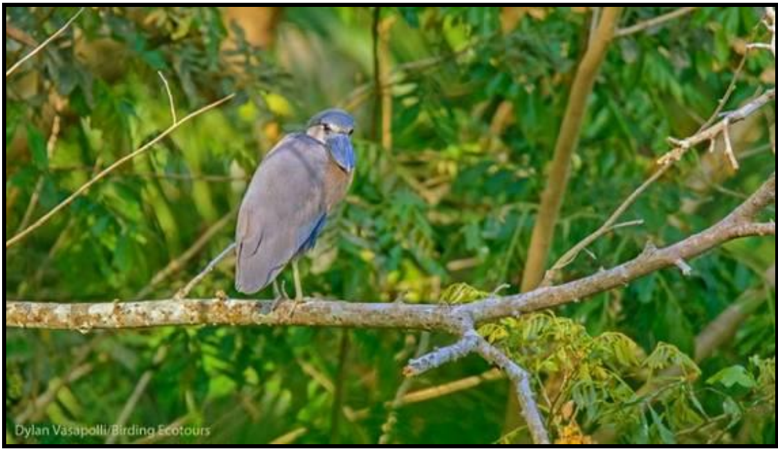
Boat-billed Heron