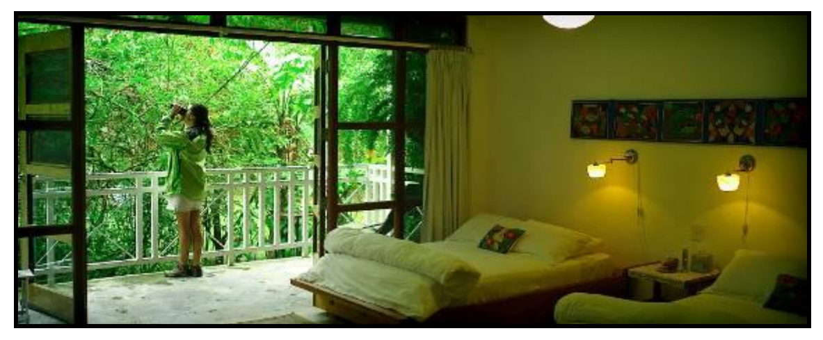
Canopy Lodge

Our time in the Canopy Family lodges ended, and we took a flight to the Bocas del Toro Province in the northeast of the country. Our next task was to investigate a new place called Tranquilo Bay Eco Adventure Lodge, which is supposed to hold a large list of birds and whose owner, Jim Kimball, had generously been inviting us for the last two years. We didn't have much information, only that the place was located on Bastimentos Island in the Bocas del Toro archipelago and could harbor birds of the Caribbean rainforest and mangrove specialists.