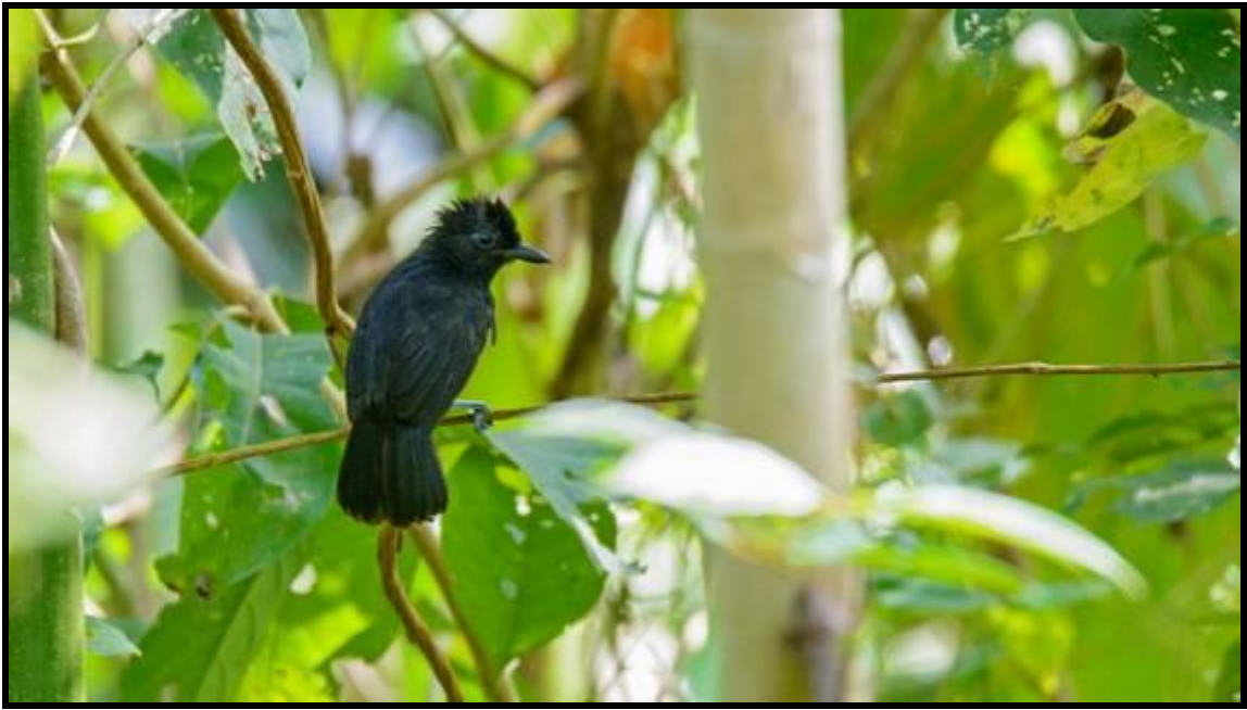
Black Antshrike

Black-crowned Antshrike Thamnophilus atrinucha Seen at several locations Plain Antvireo Dysithamnus mentalis Seen in Anton Valley