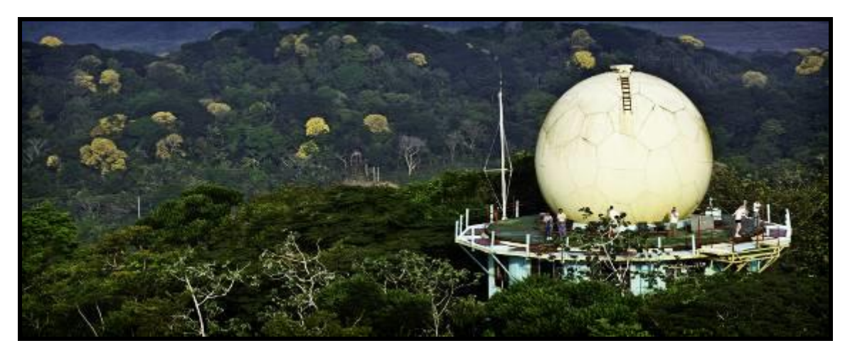
Canopy Tower

Birding Ecotours had the opportunity to return to Panama this year as part of a scouting trip to visit the Canopy Family lodges with the main idea to create a tour which can mix the three main accommodation facilities they have. The famous Canopy Tower was built in 1965 by the US Air Force to house powerful radar used in the defense of the Panama Canal. The tower played this role until 1995 and in 1999 was converted into a lodge for ecotourism and birdwatching. With its 360° view from the top of the tower the views of the Soberanía National Park are truly outstanding. Guests are able to visit the tower at dawn before breakfast and are enchanted by the calls of Slaty-backed and Collared Forest Falcons and views of Brown-hooded Parrot , Red-lored Amazon , Blue-headed Parrot , Green Honeycreeper , Plain-colored Tanager , Red-legged Honeycreeper , and with luck and persistence even the elusive Green Shrike-Vireo . We used the lodge as a base for a total of three nights, which allowed us to explore all its surroundings, including famous birding spots like the Pipeline Road and Summit Ponds.