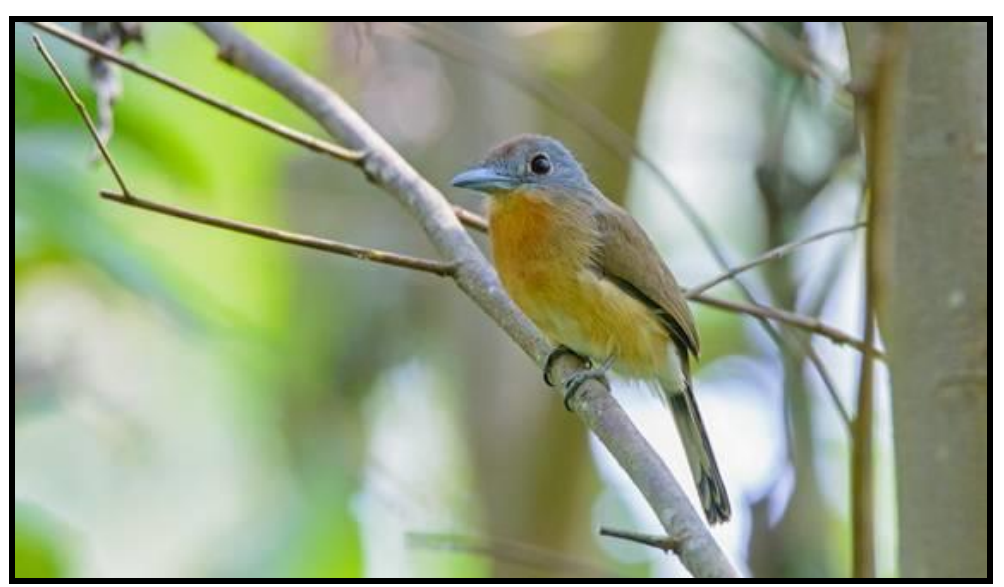
Grey-cheeked Nunlet

Barred Puffbird Nystalus radiatus Great views in the clearing grounds around the Darien Grey-cheeked Nunlet Nonnula frontalis Excellent views along the El Salto Road in the Darien. A near-endemic, found in Panama and Colombia