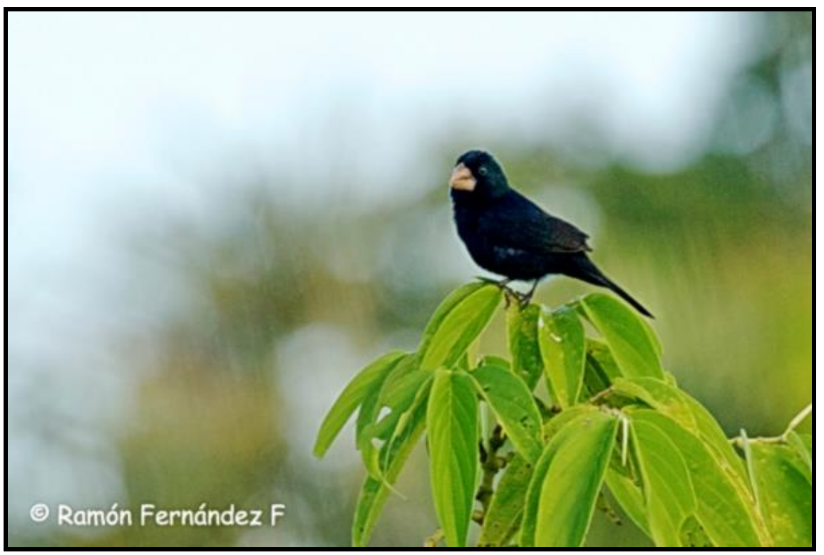
Nicaraguan Seed Finch

Nicaraguan Seed Finch Oryzoborus nuttingi Awesome views of this regional endemic during the boat ride through the Tranquilo Bay canal. One of the targets in Bocas del Toro. Found from Nicaragua to W Panama