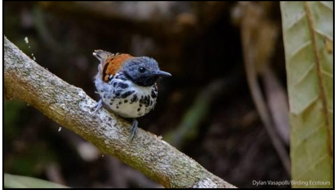
Spotted Antbird