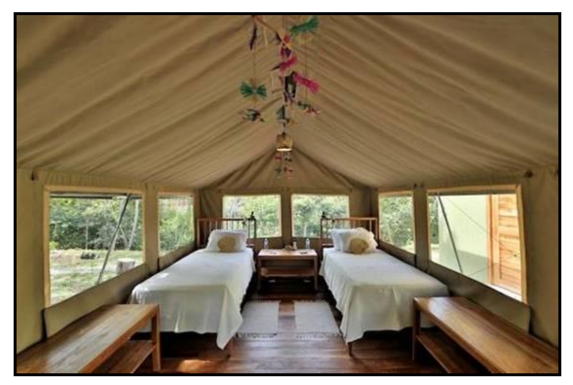
Canopy Camp

Pirre Mountain in search of Panamanian endemics, but today the airstrip in Cana has been abandoned, and there are no logistics at all. We spent three nights and four days in the Darien, using the camp as our base to explore the surroundings. We were happy with Canopy Camp, and we think that many of our clients will love it.