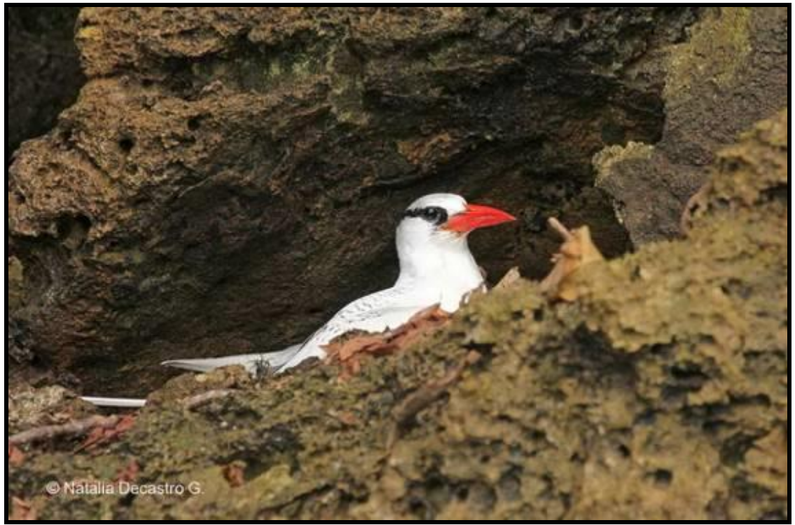
Red-billed Tropicbird