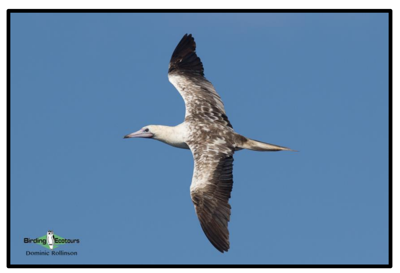
We'll search for a number of special seabirds on the Galápagos Islands, such as this Red footed Booby .