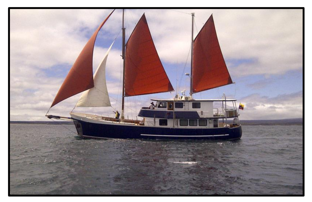
The yacht M/V Samba will take us around the Galápagos Islands during this tour.

activities such as birding, stargazing, whale watching, or simply sunbathing. The Samba accommodates 14 guests, a perfect number to enjoy the magic of the Galápagos Islands, with privacy and flexibility. Its professional, experienced, and friendly crew, and naturalist guide, are devoted to go the extra mile to make your journey a trip of a lifetime. She is a graceful, topquality craft and very environmentally friendly as well as socially responsible. She is locally owned and all the crewmembers are from the Galápagos Islands.