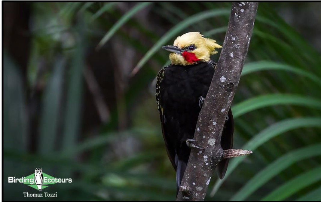
Blond-crested Woodpecker – another of the trip's major targets.

Overnight: Cabañas San Sebastian de la Selva, Andrecito