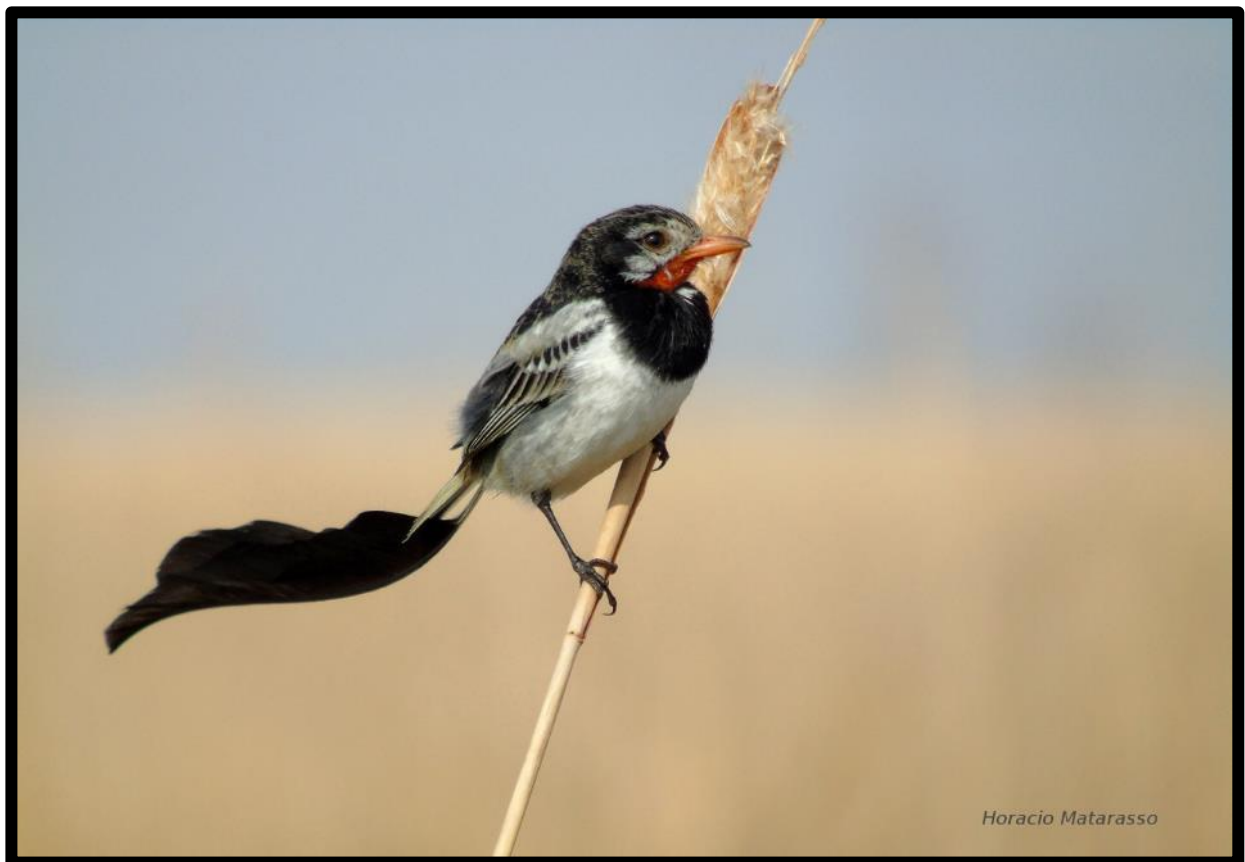
Strange-tailed Tyrant will be one of the targets on this north-eastern Argentina tour.