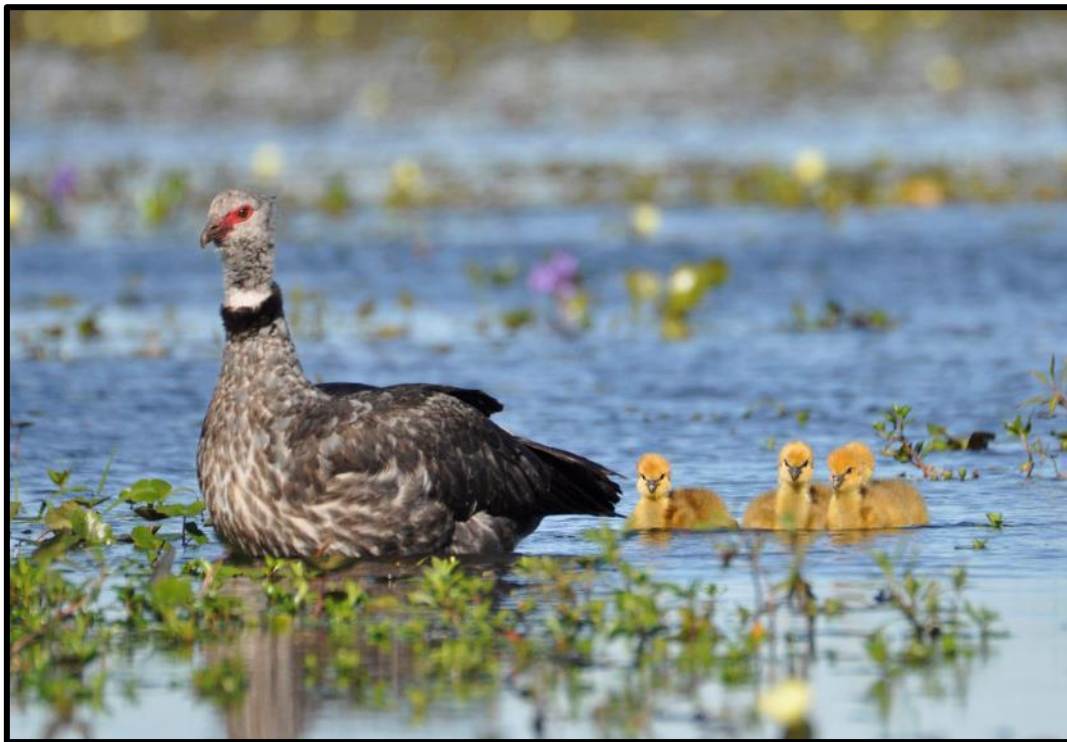
The Iberá Marshlands have good numbers of Southern Screamer.

Overnight: Hotel Dolmen/Hotel Pestana , Buenos Aires