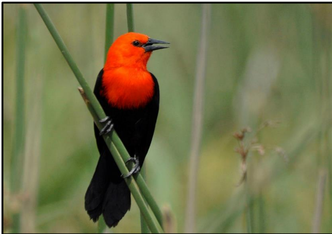
Birding the Iberá Marshlands may produce sightings of the beautiful Scarlet-headed Blackbird.

Overnight: Estancia San Juan Poriahú, Ituzaingó