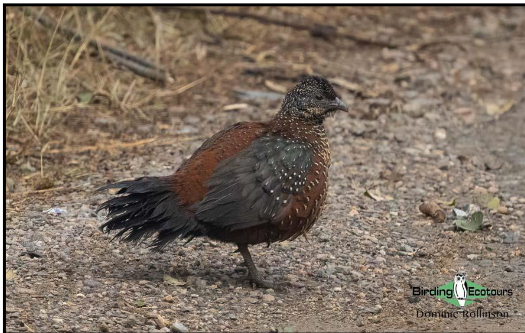
Certainly one of our biggest avian targets in Ranthambhore, Painted Spurfowl