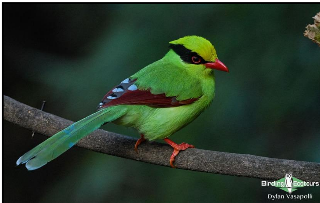
The vividly colored Common Green Magpie.