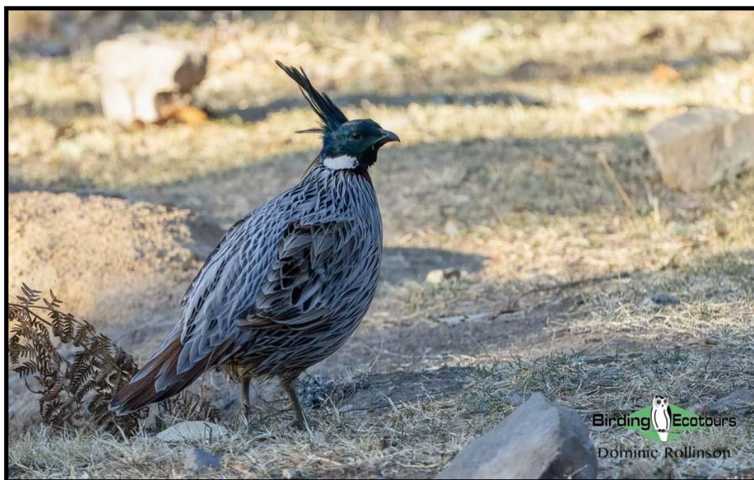
The prized Koklass Pheasant may be found above our base in Pangot.