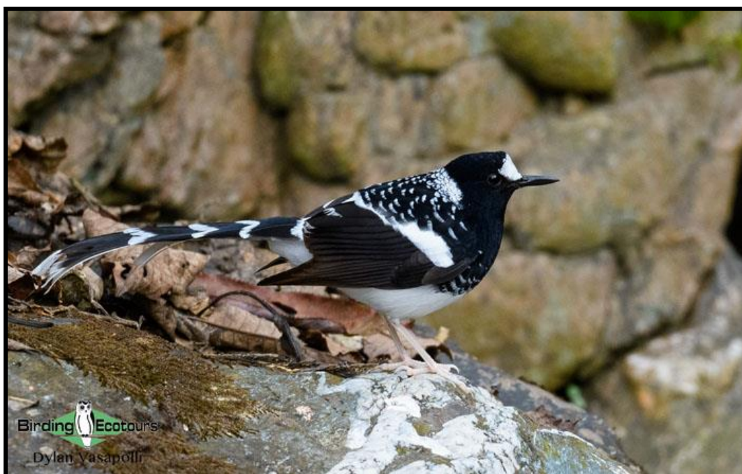
The Spotted Forktail is one of the most beautiful in the whole family.