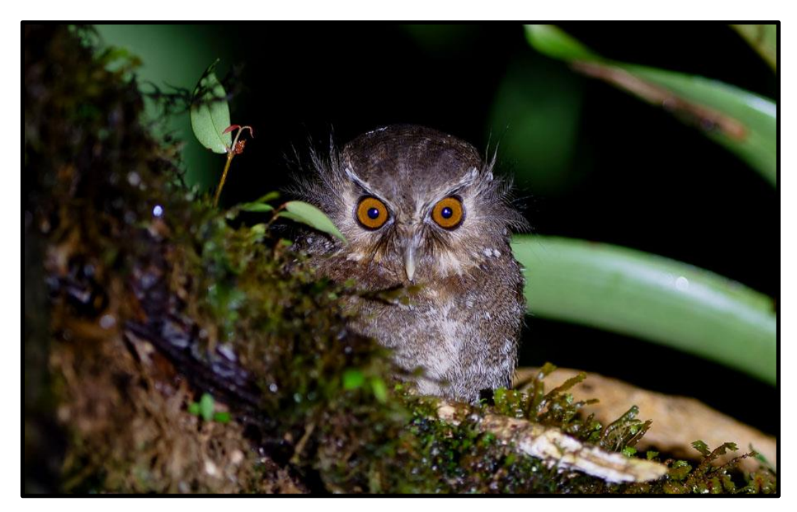
We hope to find the poorly known Long-whiskered Owlet at Owlet Lodge.

Come discover this fabulous Northern Peru birding route with Birding Ecotours, a company with two decades of experience leading birding tours in Peru!