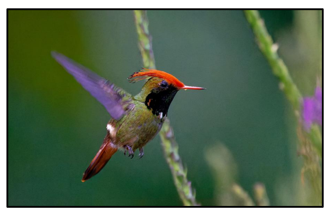
The striking Rufous-crested Coquette is another star of our tour.