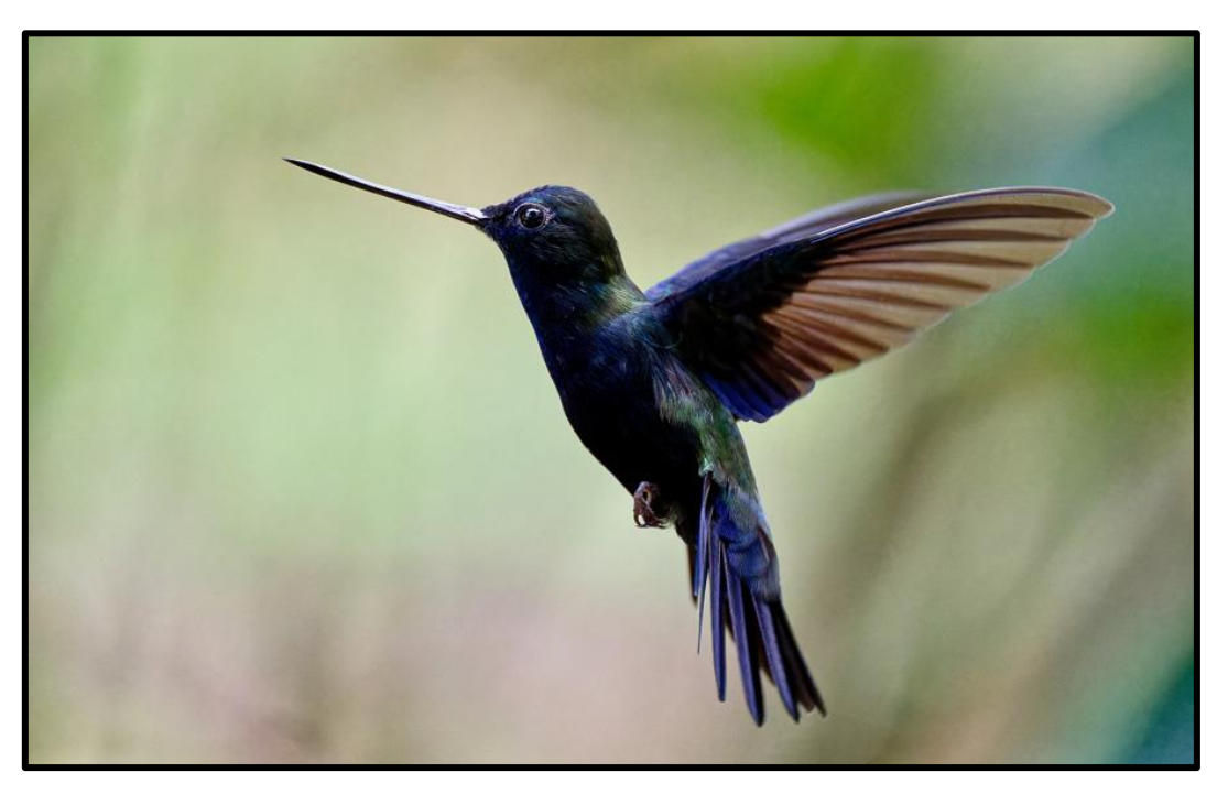
The uncommon Blue-fronted Lancebill as seen at the hummingbird feeders.

We will have an early start to explore the buffer zone of the Cordillera Escalera protected zone, visiting the Aconavit private reserve. In this area we will likely have good views of Cliff Flycatcher , White-tipped Swift , Slaty-capped Shrike-Vireo , Slate-colored Grosbeak and, if we are lucky, Military Macaw .