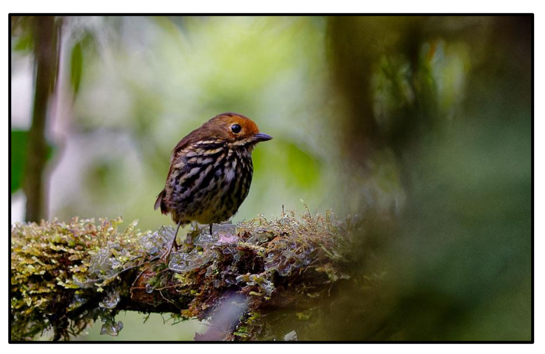
Ochre-fronted Antpitta is one of the tour specials.