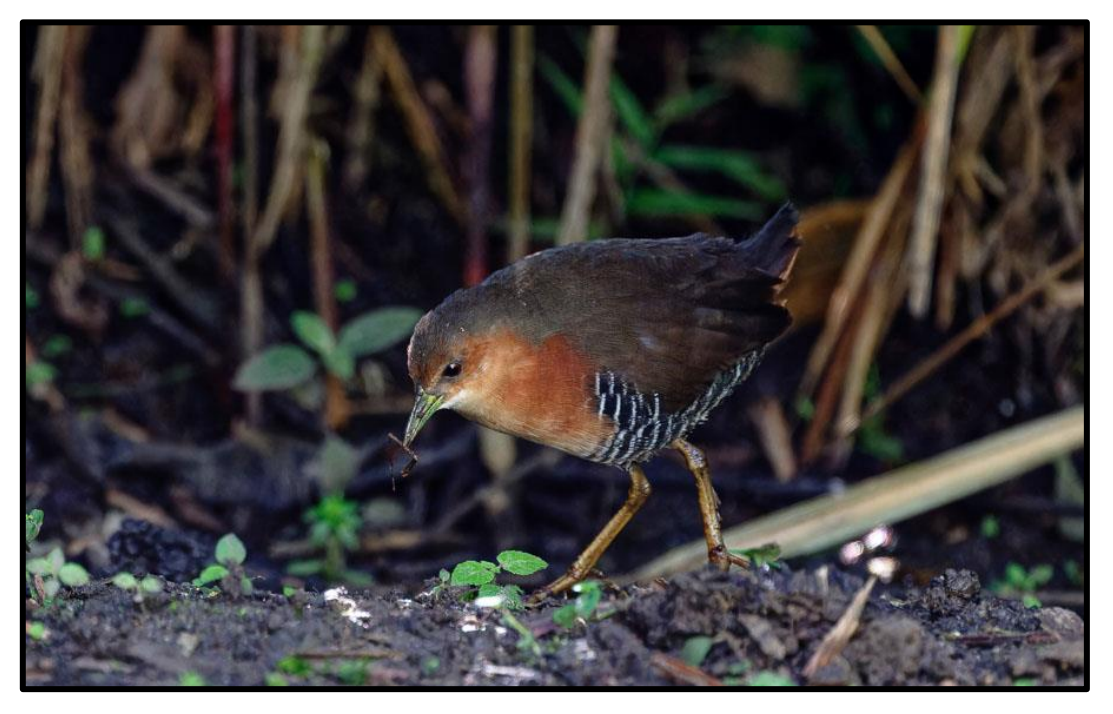
The secretive Rufous-sided Crake at the Moyobamba feeding station.