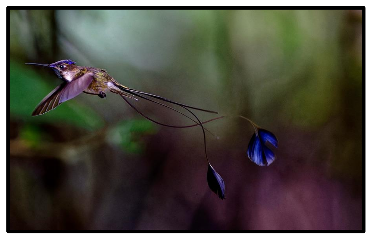
The Marvelous Spatuletail is the star of this tour.