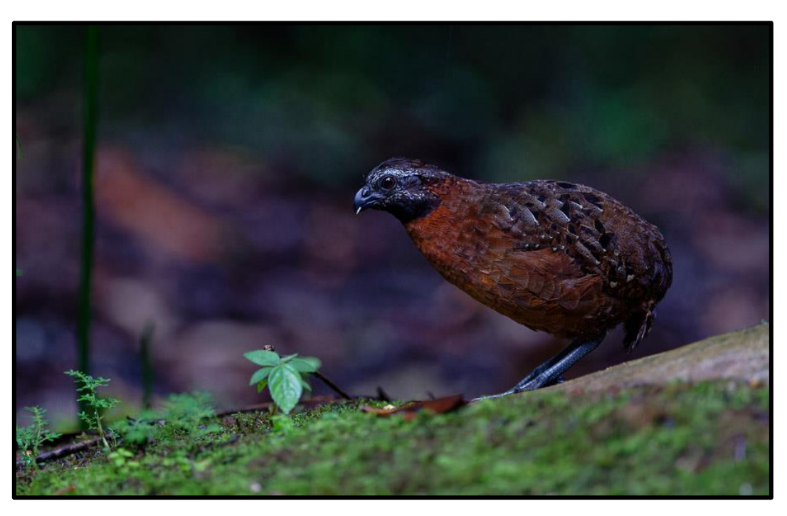
Rufous-breasted Wood Quail at Arena Blanca feeders.