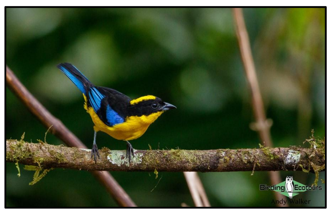
Blue-winged Mountain Tanager around Moyobamba.