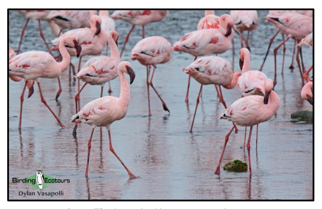
Lesser Flamingos should entertain us on the coast.

The ideal experience, and one we boldly strive for, is to combine visiting the world's remaining wilderness areas with that of special-interest wildlife photography. Our photographic guides are all highly qualified naturalists and experienced photographers themselves, and we specialize in birds, mammals, and of course the unique landscapes and cultures experienced along the way. Key to getting exceptional images is an intimate knowledge of wildlife subjects and their behavior, and our guides will go that extra mile for you to get that perfect shot. That said, the wildlife is never put under any undue stress and will be respected at all times.