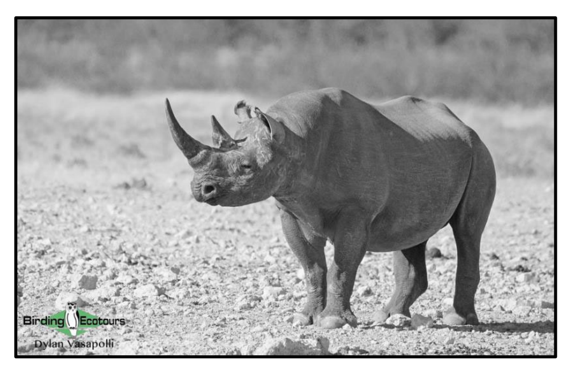
Etosha is arguably the best place on earth to photograph Black Rhinoceros!