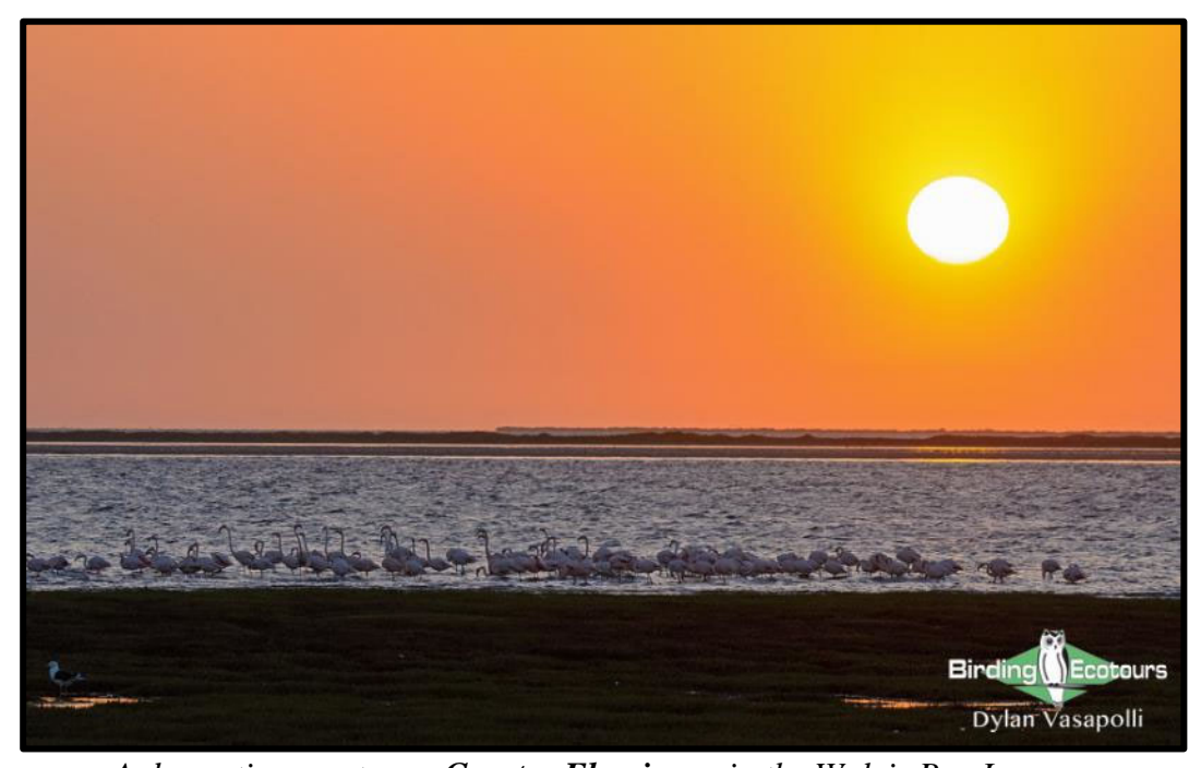
A dramatic sunset over Greater Flamingos in the Walvis Bay Lagoon.