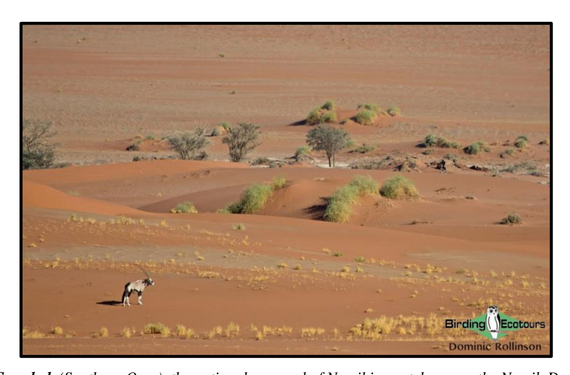
A Gemsbok (Southern Oryx), the national mammal of Namibia, watches over the Namib Desert.

Upon arrival in Windhoek the group will be met by our representative and assisted with the charter flight to our first camp, Little Kulala Camp, for two nights. The camp is located within the arid Namib Desert on the 37,000-hectare private Kulala Wilderness Reserve and close to the iconic dunes of Sossusvlei, by virtue of having a private gate into the park. A waterhole in front of the main building provides the opportunity to see Gemsbok (Southern Oryx), Springbok, Bat-eared Fox, Aardwolf, Common Ostrich, and Black-backed Jackal. Spotted Hyaena can be heard at night. The Namib, a vast sea of red sand dunes, is one of the most arid deserts in the world.