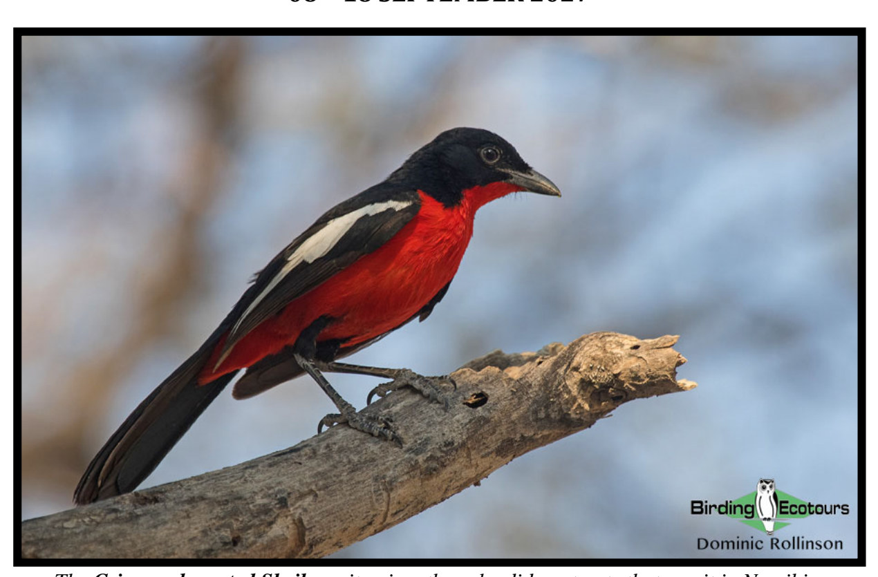
The Crimson-breasted Shrike epitomizes the splendid contrasts that await in Namibia.

08 - 18 SEPTEMBER 2026 08 - 18 SEPTEMBER 2027