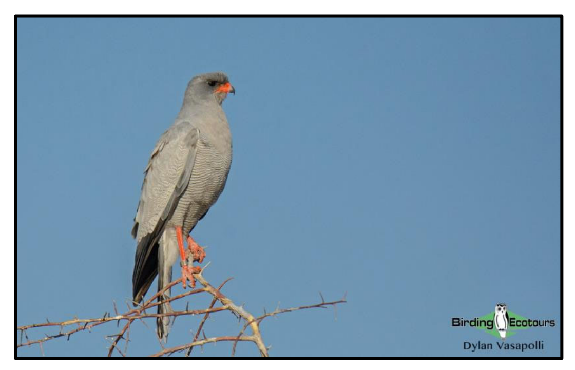
The ghost-like Pale Chanting Goshawk are photogenic subjects in the thornveld of Etosha.

We will stay in an intimate safari camp discreetly hidden on Ongava Game Reserve. Intense wildlife sightings in and around the camp are possible thanks to its popular waterhole.