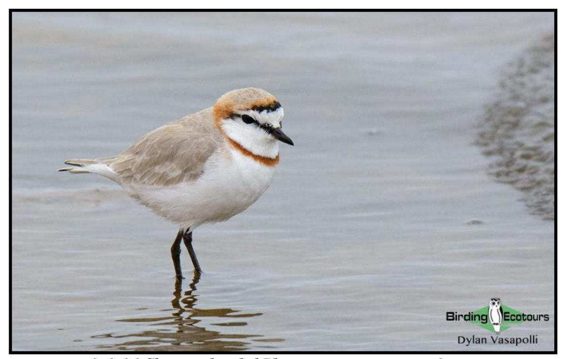
Delightful Chestnut-banded Plovers are a target in Walvis Bay.

We will overnight at the comfortable Cornerstone Guest House, situated in Swakopmund.