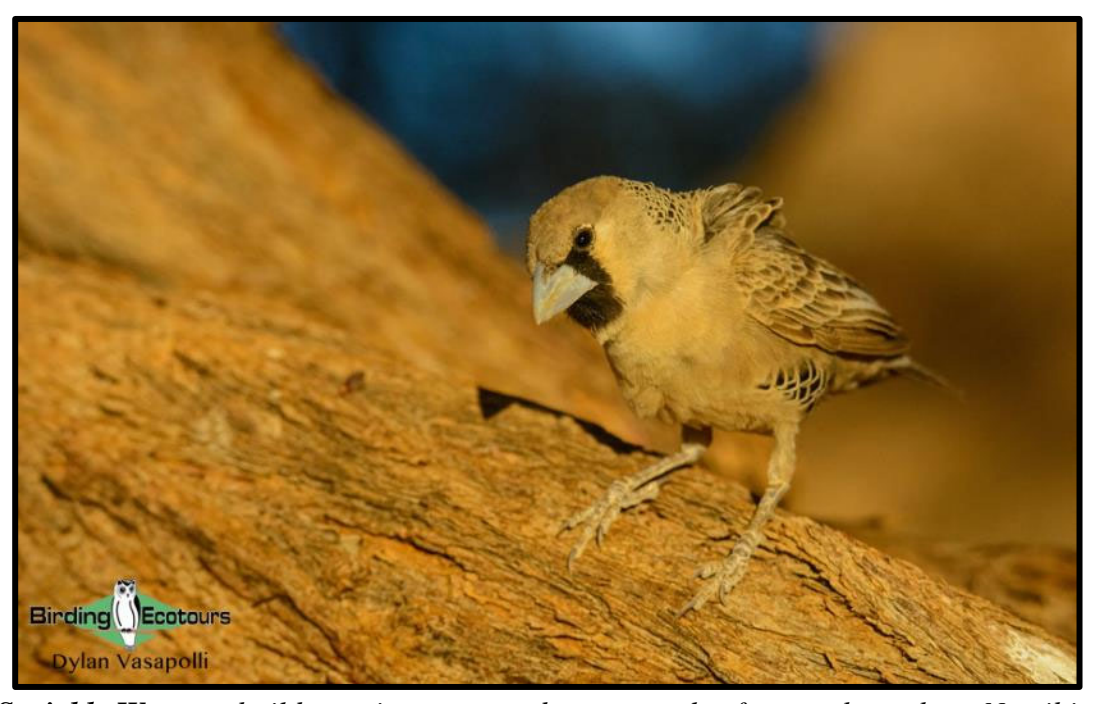
Sociable Weavers build massive nests, and are a regular feature throughout Namibia.

<u>Little Kulala Camp</u> comprises a reception, lounge, bar, dining room, library, wine cellar, curio shop, and veranda.