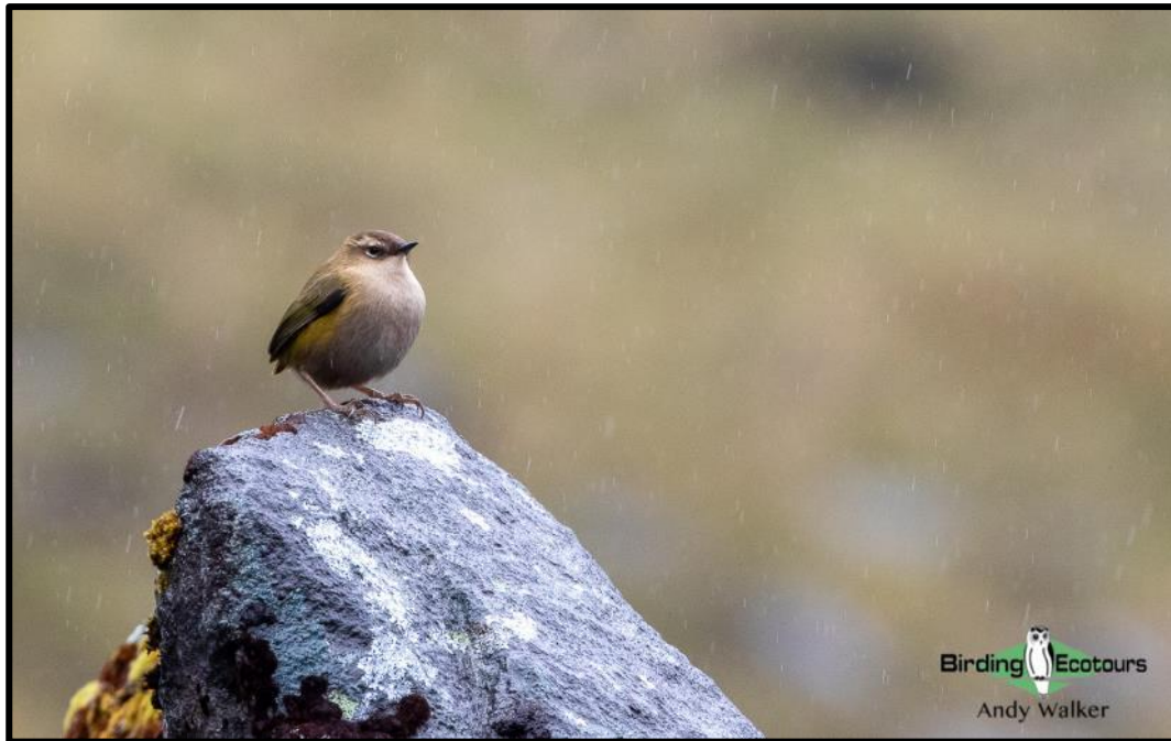
The endemic New Zealand Rockwren performed excellently for us in the cold rain.

After a warming cup of tea, coffee, or hot chocolate, and a snack, the group set out on a boat trip on Milford Sound where Fiordland Penguin was the pick of the birds seen in some spectacular glacial scenery. Some of the group also saw the Critically Endangered (IUCN) Fiordland subpopulation of Common Bottlenose Dolphin .