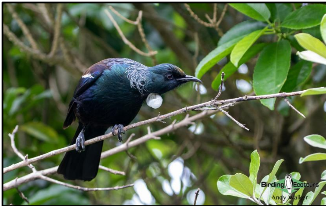
One of the commonest and most widespread of the New Zealand endemics, the Tui is one charismatic and attractive bird, with an incredible vocal repertoire.

We dropped back into town for dinner and bed, ready for the pelagic the following day.