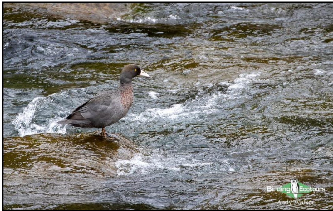
Blue Duck gave us some great views in a fast-flowing mountain river.

We started the day with some birding not too far out of Rotorua, where we found our first North Island Robins , we also saw several other species here, with some of the group getting brief views of New Zealand Falcon . A mix of common and widespread endemics were also found, and a Shining Bronze Cuckoo was heard distantly calling but couldn't be seen as it was too distant. Next, we moved on to Pureora Forest Park, where we found our first Tomtit . It was a bit high in the canopy, but eventually came a bit lower. Here, we also found Yellow-crowned Parakeet , one of our main targets for the site, Pacific Long-tailed Cuckoo , and our best views so far of New Zealand Kaka . We commenced our journey south, hearing Australasian Bittern and New Zealand Fernbird along the way in rather windy conditions.