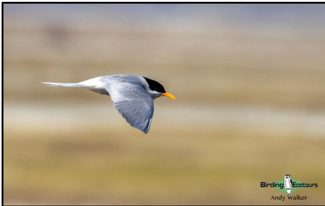
The endemic and attractive Black-fronted Tern was a popular bird with the group.

In the afternoon, after saying goodbye (and a huge thank you) to Richard, who had got prior eBird New Zealand Bird Atlas commitments, we called in at the Tasman Delta near Twizel. Here we got some good views of Black Stilt , closer than our earlier sighting and we also got to see Wrybill , Double-banded Plover , South Island Oystercatcher , and Black-fronted Tern all on their braided river breeding grounds and all set in front of spectacular snow-covered Mt Cook.