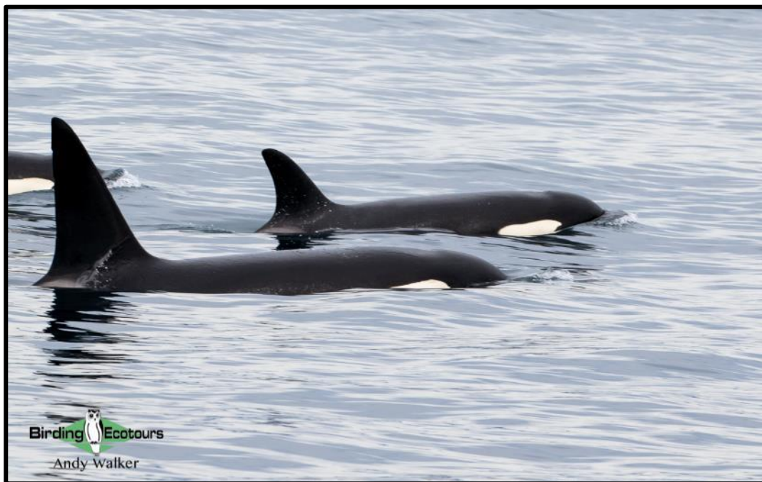
A large pod of Killer Whales (Orcas) provided another highlight of our morning on the sea off Kaikoura.