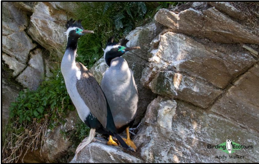
Spotted Shag is one seriously stunning bird when in breeding plumage.

colonizer in New Zealand), Great Crested Grebe , and Eurasian Coot . Driving along the coast into Kaikoura we stopped briefly at a New Zealand Fur Seal and Spotted Shag colony.