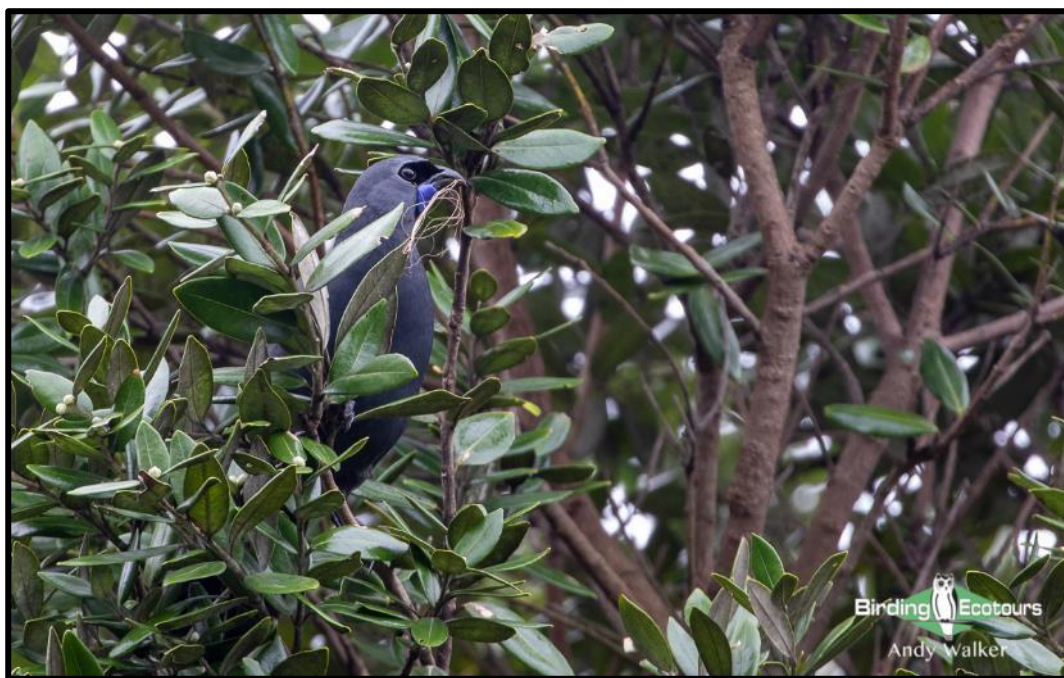
This North Island Kokako was collecting nesting material when we found it.

It was also great to hear the bird song here, very few non-native species were present and the song filling the air was pretty much just that of native species, giving a glimpse into the past, and what it must have been like hundreds of years ago before settlement. After an enjoyable day we headed back into Auckland where we spent the night.