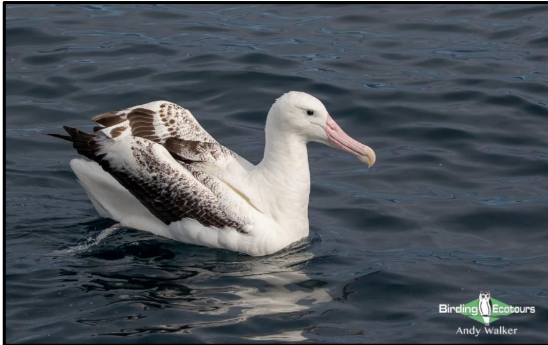
The humongous Southern Royal Albatross sat behind the boat and gave excellent views. This species has a wingspan of up to a whopping 142 inches (3.6 meters)!